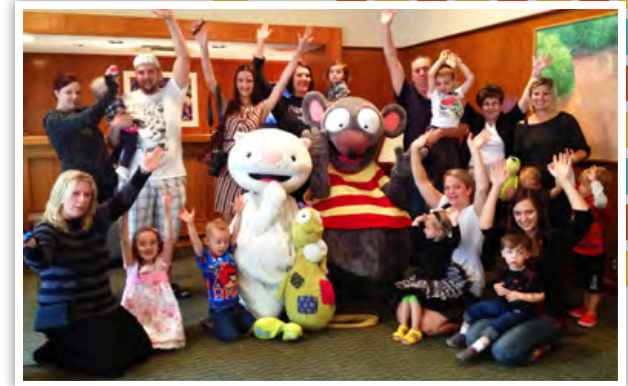
Meet and greet