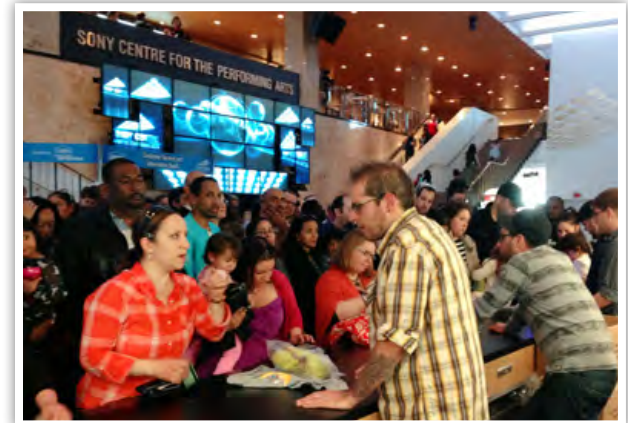
Sponsor display booth